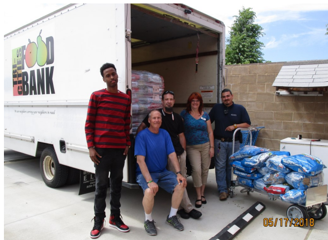
Receiving donations from the Tri-Cities Food Bank

Nanuk came to our office on May 5, 2018. Shelter staff thought he had to have a family looking for him, but, sadly, after his 3-day hold was complete no one had come to claim him. So he was placed for adoption and we hoped he would find the perfect adventure family. Then on June 6, 2018, the day before he was to be transferred out, a wonderful family came in to the shelter asking if we just happen to have seen their dog, Lobo. We saw the photo and, sure enough, it was him! The son started to cry, we cried. It was such an amazing experience - they are not on social media, and just happen to hear about our shelter so they came in. What a wonderful outcome and Lobo was so happy to see them.